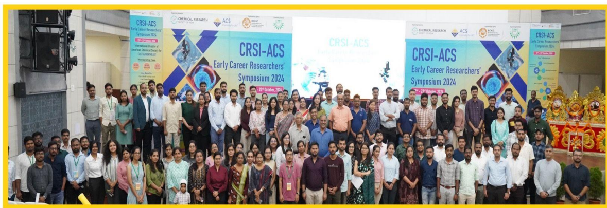
CRSI–ACS Early Career Researchers’ Symposium 2024

Outstanding oral and poster contributions were recognised through awards. The symposium strengthened engagement between ACS and the early-career research community in East and Northeast India.